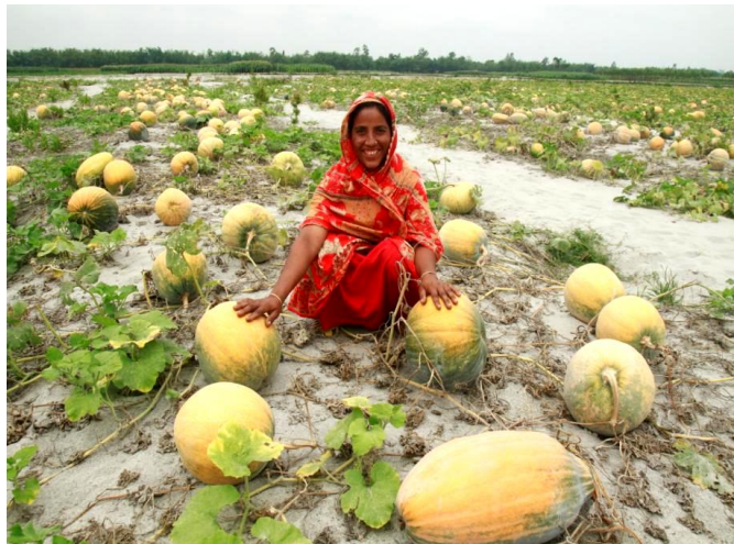
Figure 1: Farmer at the Practical Action project site, Gaibandha district, Bangladesh.

These sandbars can be made productive by growing pumpkins and other crops using the pit cultivation approach (by digging small pits and lining these pits with compost). Accessing these sandbars for cropping can help landless families diversify their incomes, help them overcome seasonal food shortages and facilitate a process of asset building alongside reducing the risks which threaten their livelihoods.