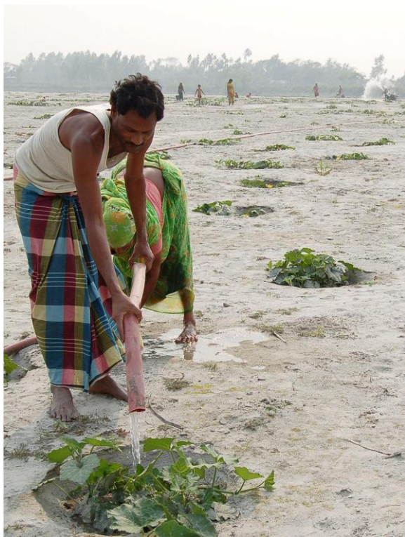
Figure 4: Watering the pumpkin plants.

The agricultural production in barren and unproductive sandbars is an innovative, low cost technique that has been developed through a series of action research activities since 2005 in Gaibandha and Rangpur districts, Rangpur Division. Practical Action Bangladesh initiated a trial with 177 farmers in 11 sandbar spots in 2005 with the objective of ‘something is better than nothing’. The innovation was part of Practical Action Bangladesh’s Disappearing Lands project which went on to win the Asia-pacific (APFED) gold award in 2007.