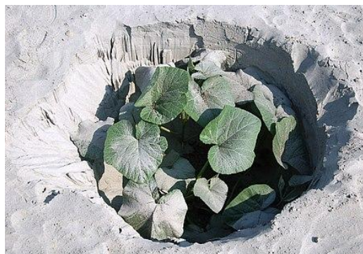
Figure 3: Pumpkins growing on sandbar (communal) land. Early in the season showing young plants emerging from planting holes.

Large scale irrigation is not always necessary as the sandbars are usually close to the river and watering can be done by hand. In the initial stages, surface water is used for irrigation. (Where a source is available. e.g. water channels that are created as the river recedes. These water channels disappear in the dry season). Ground water can be used for irrigation when the surface water dries out. Pumpkin fields can be irrigated using a pump and borehole. A low-cost reservoir made with polyethylene sheet can be used for optimise water use. Water is pumped from the borehole to the reservoir through polyethylene pipe/hosepipe and farmers then use buckets to take water from the reservoir to water the individual pits. The quantity and frequency of irrigation depends on the type of soil and season (end stage of the production benefitted by rain water).